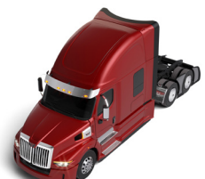
36" Mid Roof